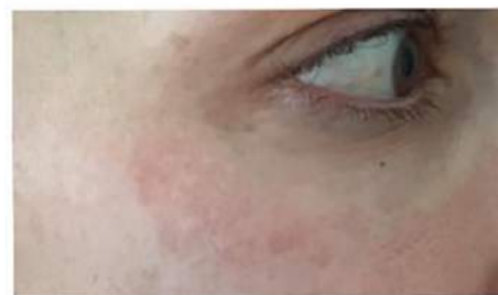
FIGURE 1 A, 1 day after treatment. B, 6 weeks after treatment. C, 4 months after treatment

We have prescribed both patients hydroquinone 5% (HQ) in combination with tretinoin 0.05% for bleaching of their hyperpigmented skin after which a mild-to-moderate improvement was reached in both patients. After 4 months, patient 1 was successfully treated with a superficial herbal peel (Green Peel by Dr. Schrammek) and the pigmentation did not re-occur (Figure 1).