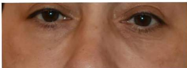
FIGURE 2 A, Directly after treatment. B, 1 month after treatment. C, 9 months after treatment

Patient 2 was treated after 2 months with also the same superficial herbal peel with only minor improvement. Two weeks later, a glycolic acid peeling (Neostrata, 20% glycolic acid) was performed with little further improvement. After this, patient 2 was treated four times with thermomechanical ablation (Tixel on mode 10/500) which resulted in the result as shown in Figure 2C after 9 months. Tixel is a nonlaser fractional treatment technology that transfers thermal energy to the skin through a matrix of tiny pyramid-shaped pins made of biocompatible materials covering a treatment area of 1 cm 2 .